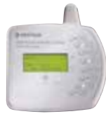
EasyTouch System Wireless Controller