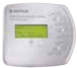
EasyTouch System Indoor Control Panel (for 4 or 8 function control)