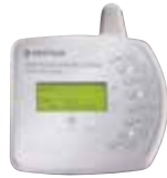
EasyTouch System Wireless Controller